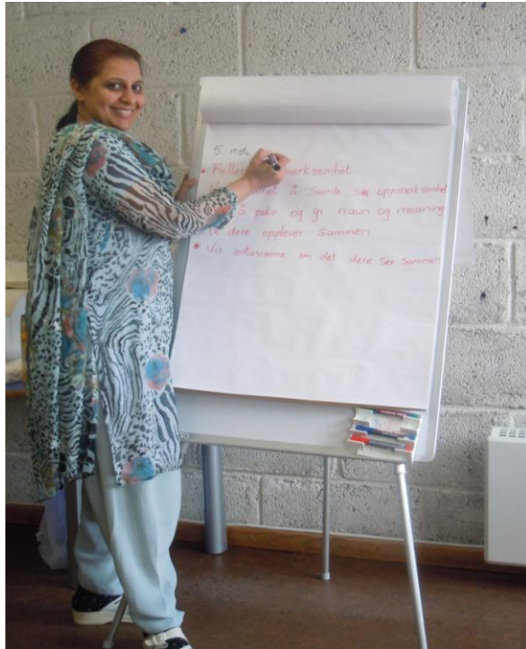
Picture 1 and 2: Facilitators in the minority version of the ICDP teaching and role playing